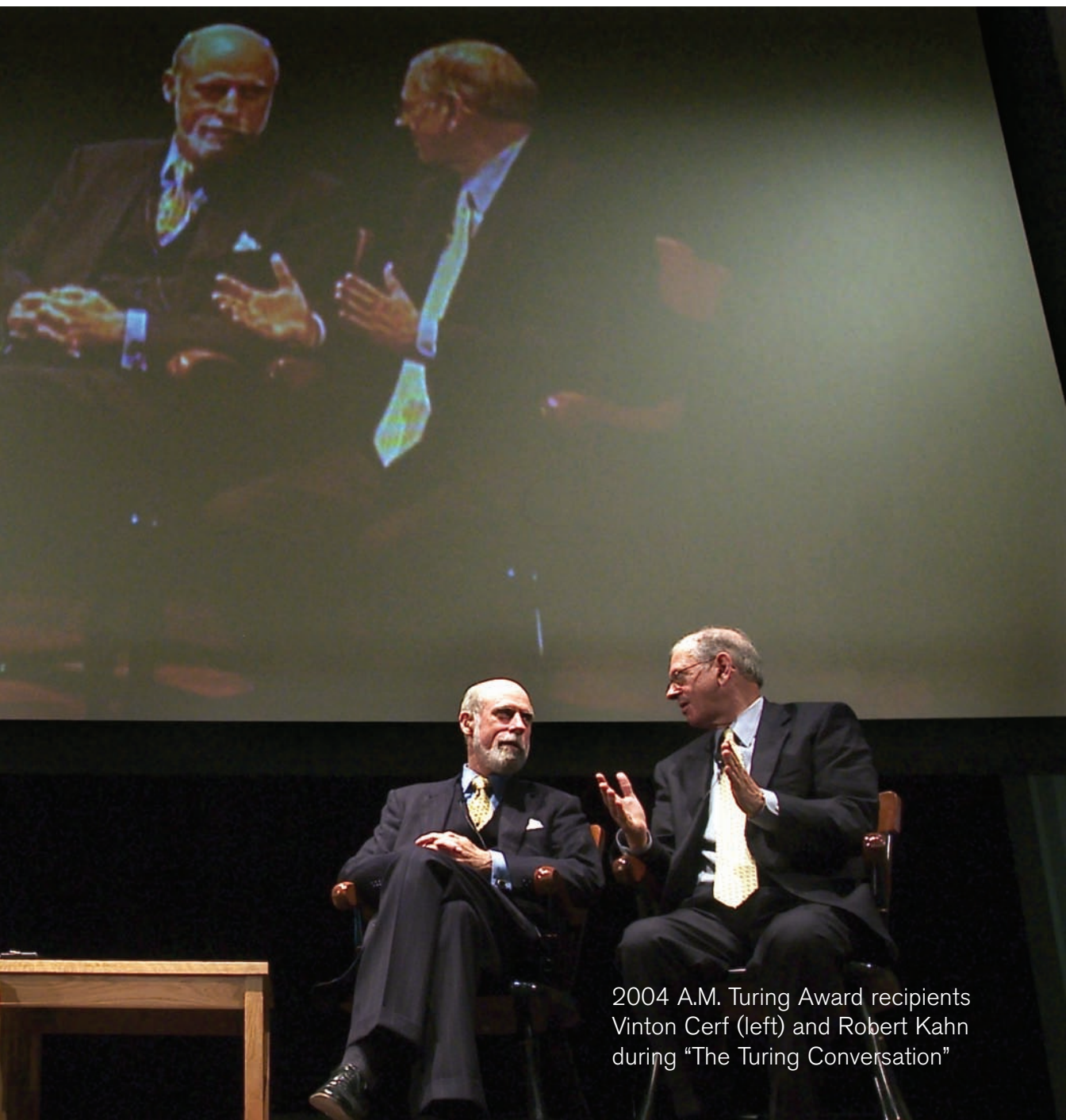
2004 A.M. Turing Award recipients Vinton Cerf (left) and Robert Kahn during "The Turing Conversation"

ACM works to communicate the fundamental role that computing plays in shaping all scientific pursuits, as well as our future.