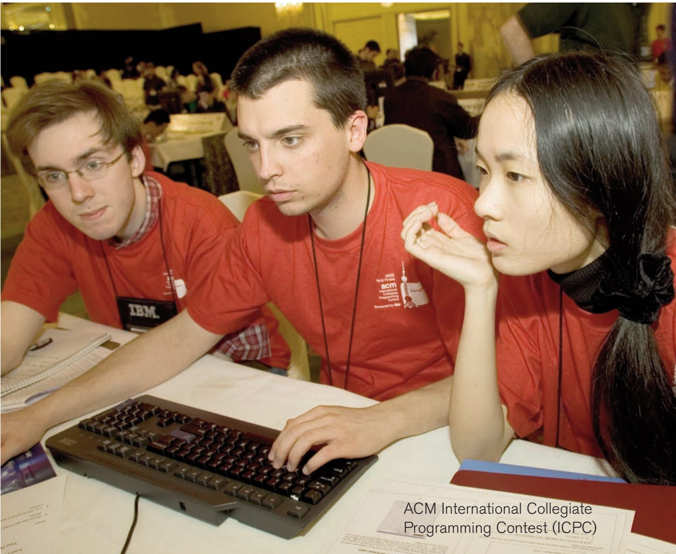
ACM International Collegiate Programming Contest (ICPC)